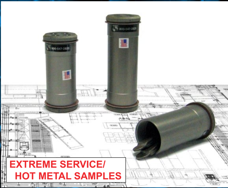
EXTREME SERVICE/ HOT METAL SAMPLES