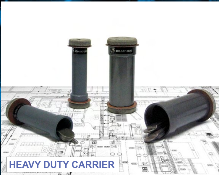
HEAVY DUTY CARRIER